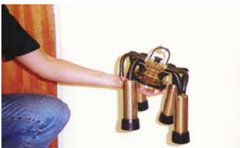
Light-weight milking cluster (1.6 kg)