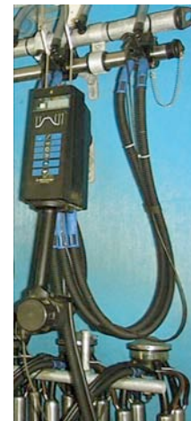
Light-weight milking cluster, tubes and pulsator in a tie stall (6.0 kg)