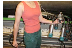
Traditional milking cluster (2.5 kg)