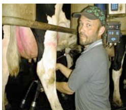
Work near the body and not with extended joints