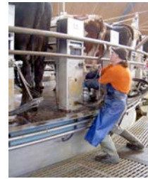
Unsuitable working postures during milking in tie stalls, parlour and rotary milking systems