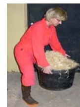
Move the feet - do not twist the back